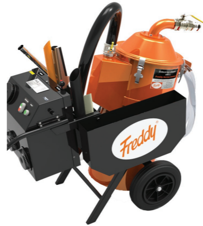
Superminor THE COMPACT AND FLEXIBLE SOLUTION