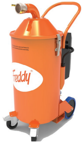
Micro OFFERING VERSATILITY, MOBILITY AND AFFORDABILITY