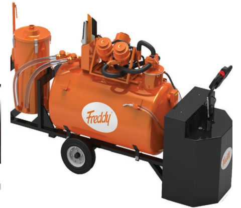
Mark V Battery Propelled OUR LARGEST FREDDY, BATTERY PROPELLED