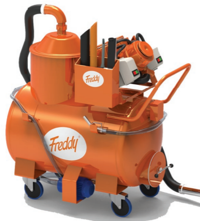
Ecovac CONTINUOUS FILTRATION FOR MINIMUM DOWNTIME