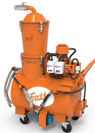
CHU CONTINUOUS FILTRATION FOR MINIMUM DOWNTIME