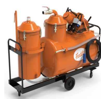
Max COMPACT DESIGN WITH A LARGE CAPACITY