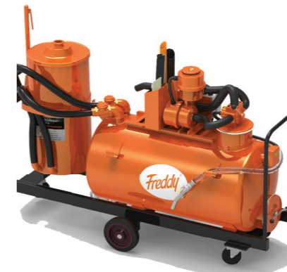
Mark V OUR MOST POWERFUL, CUSTOMISABLE SOLUTION