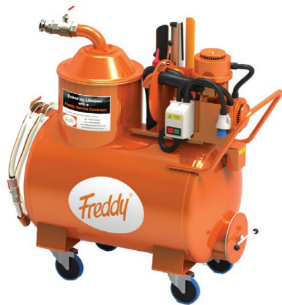
Midi COMPACT DESIGN WITH A LARGE CAPACITY