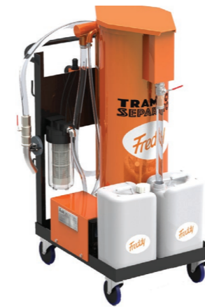
Tramp Oil Separator REMOVING TRAMP OILS EFFECTIVELY AND ECONOMICALLY