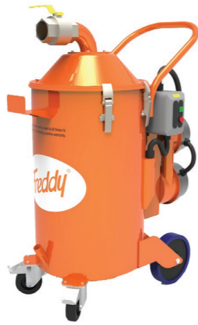
Micro Plus THE COMPACT AND FLEXIBLE SOLUTION